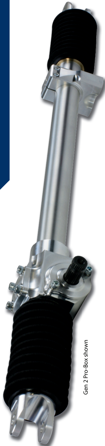
Gen 2 Pro-Box shown